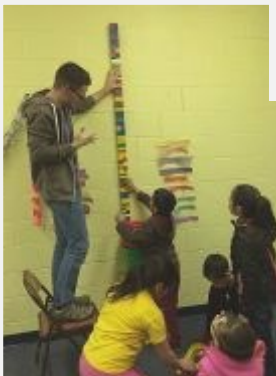
*Pictures are of youth staff interacting with children working to break the cycle of violence.