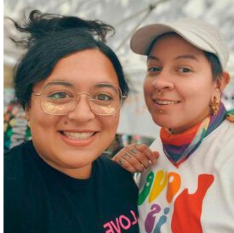
Fort Wayne PRIDE Festival