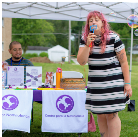
Abbett Elementary Back to School Bash