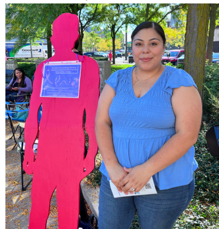
The Mayor's Commission Silent Witness Display