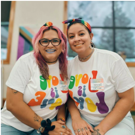
Plymouth Church PRIDE Event