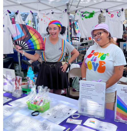
Fort Wayne PRIDE Festival