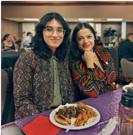
Recovery Doesn't Have to Be a DRAG