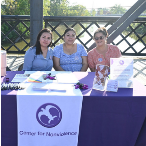
YWCA Flowers on the River for DVAM