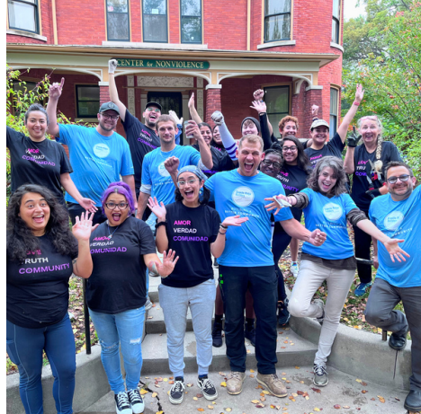
Granite Ridge Builders Volunteer Day