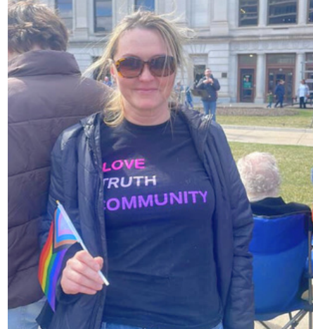
No Hate in Our State Protest